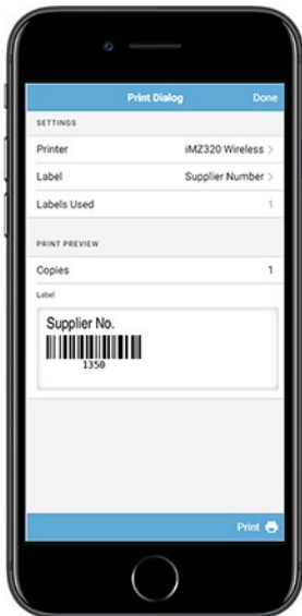
Barcode Label Printing